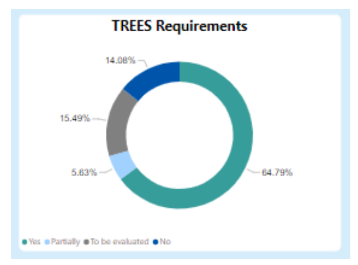
Figure 1 - TREES Requirements chart